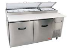
2 Doors PTP