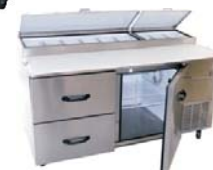
2 Drawers, 1 door PTP 2C