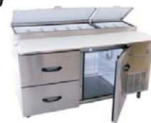
2 Drawers, 1 door PTP 2C